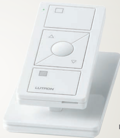
Pico on pedestal (sold separately)