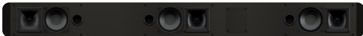
LX - 7 without grille

Krix has proudly engineered and manufactured speakers in Australia since 1974.